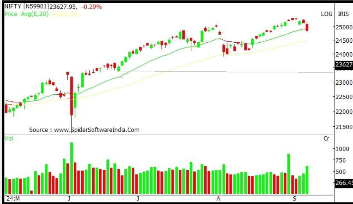
Daily Chart (23,603.35)