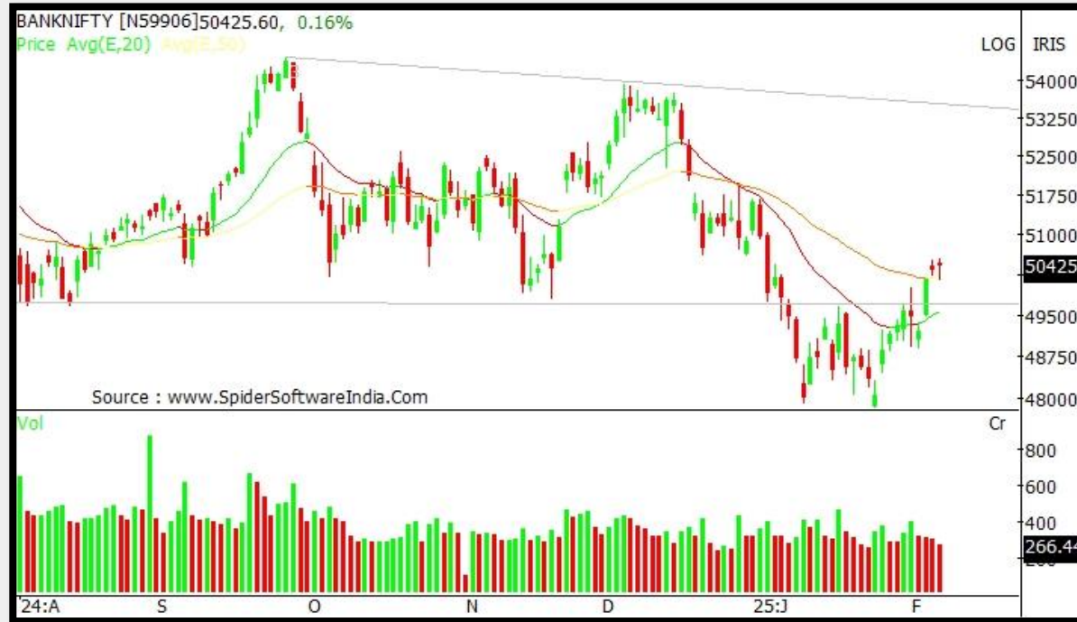
Daily Chart (50,382.10)